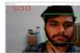
Fig 8. Sad Emotion

The output images of different images are shown from figure number 5 to 8. When numerous faces were present in the same image and were at the same distance from the camera, the algorithm failed. It was discovered that when the number of photos increases, accuracy decreases due to over-fitting. Also, when the number of training photos is reduced, accuracy remains low. The ideal number of images was found to be in the range of 2000–11,000 for FER to work properly.