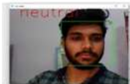
Fig 7. Neutral Emotion