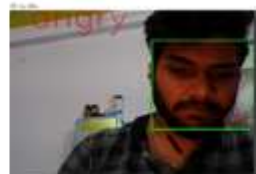
Fig 6. Angry Emotion